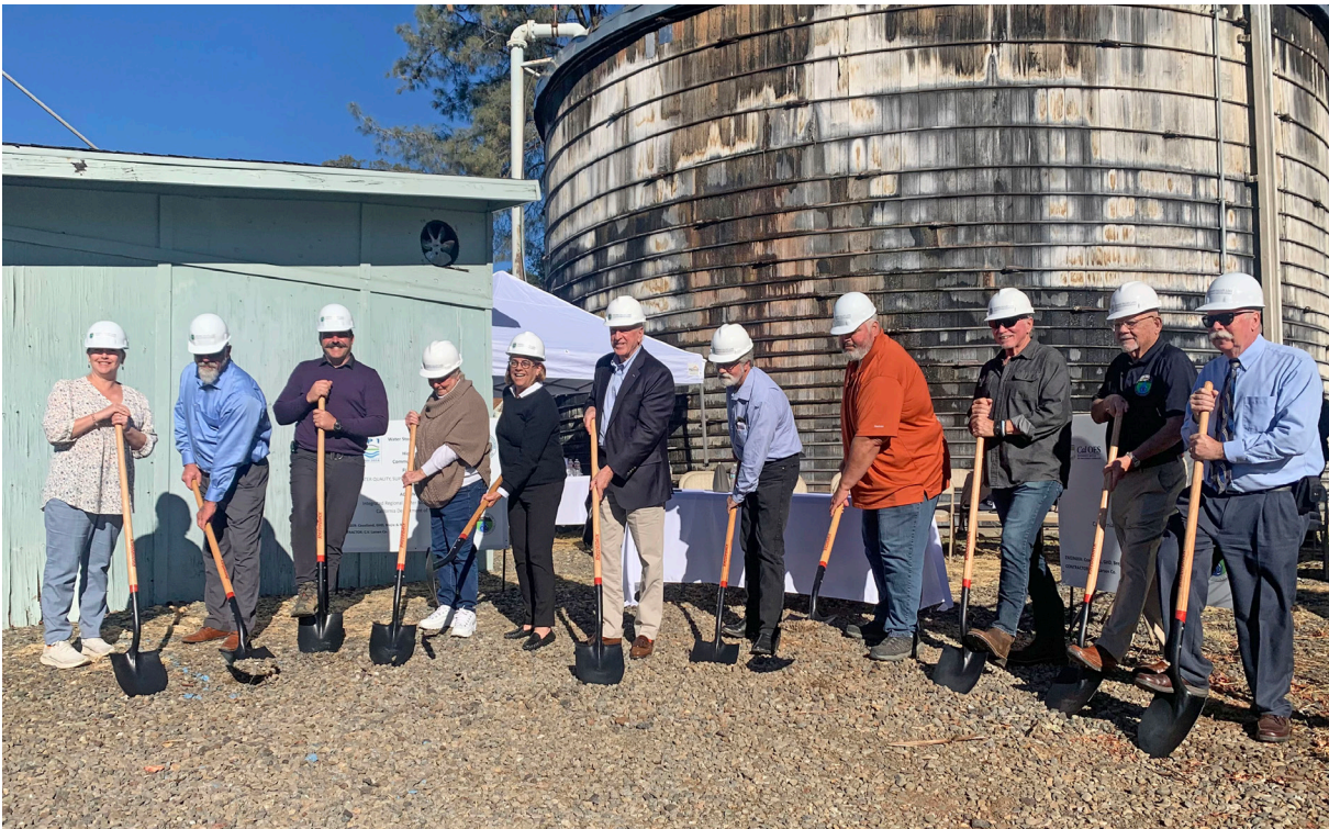
▲ Federal, state and county dignitaries join CSD Board members and staff in groundbreaking ceremonies in front of leaking Tank 9 on Eagle Rock Road.