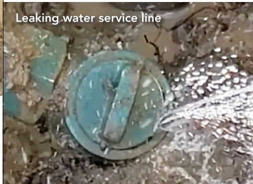
Leaking water service line

The District believes water conservation to be a way of life, not just measures taken during times of drought. Water that leaks through pressurized water lines will eventually be re-treated and re-distributed which increases the cost of service for the District. Therefore, the Water Mains project aims to offset the increases in cost of service by replacing this damaged infrastructure.